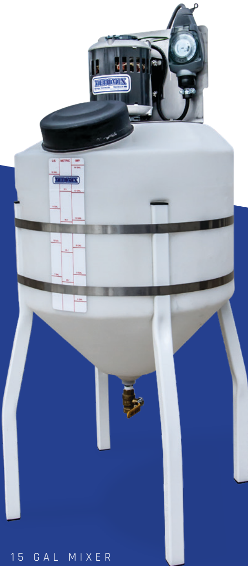
15 GAL MIXER

Consistent doses. Reduced waste. Healthy livestock.