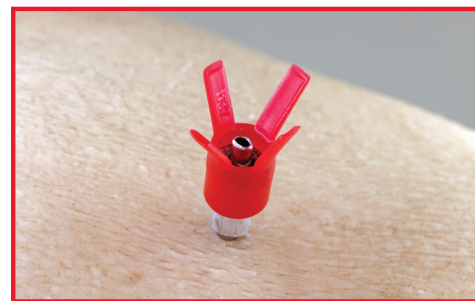
Broken needle with extraction collar in an animal