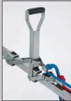
New Alternate traction